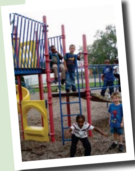
Friendly House Association Allocation of Expenses